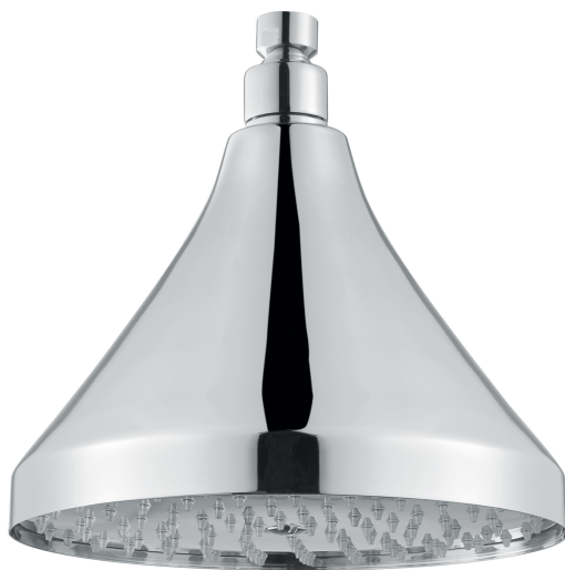
BDD-BIS-510-XX BRISTOL ROUND SHOWER HEAD DIA. 200

A member of SANIPEXGROUP www.sanipexgroup.com